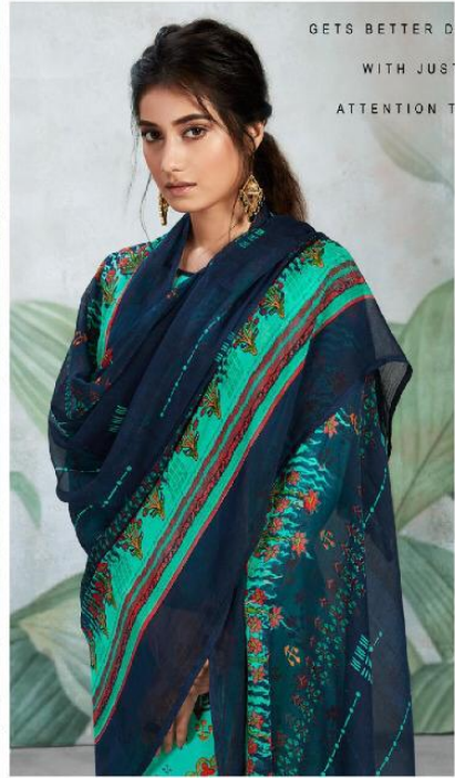
STYLE - 13009

queen couture THIS SEASON, YOUR LOOK GETS BETTER DEFINITION WITH JUST A LITTLE ATTENTION TO DETAIL.