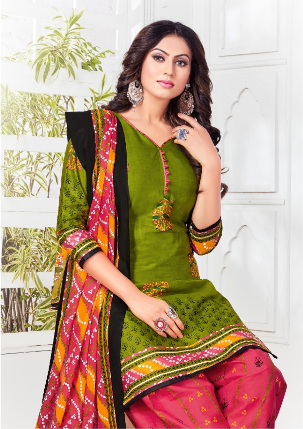
This season, your look gets better definition with just a little attention to detail.