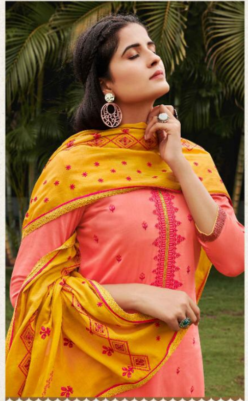
The collection was a perfect blend of Indian silhouettes & contemporary style. 5528-