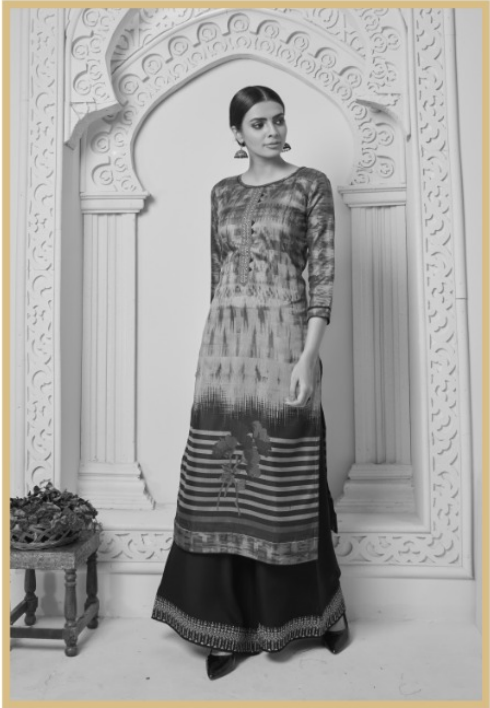
The beauty of a woman is seen in her eyes, because that is the doorway to her heart, the place where love resides.