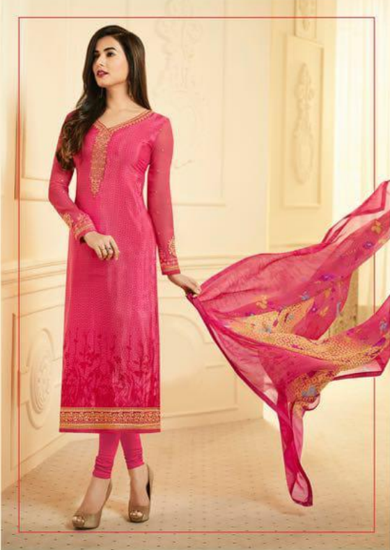
FRENCH / shorts & feet special in every occasion. Feel the liveliness in all beautiful / AFFAIR