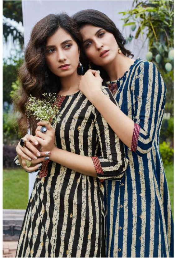
The Blast of bright colors-one of this SEASON'S MOST favorite f