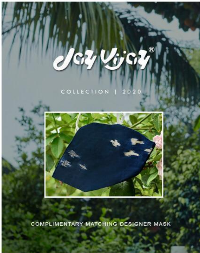
COMPLIMENTARY MATCHING DESIGNER MASK