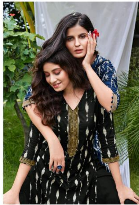
FRESHLY PICKED-COLORFUL OUTFIT THAT WORK FOR EVERY OCCASION