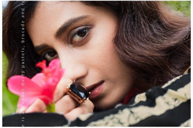
Soft focus - this season's FRESH palette is all about dusty pastels, brocade and texture