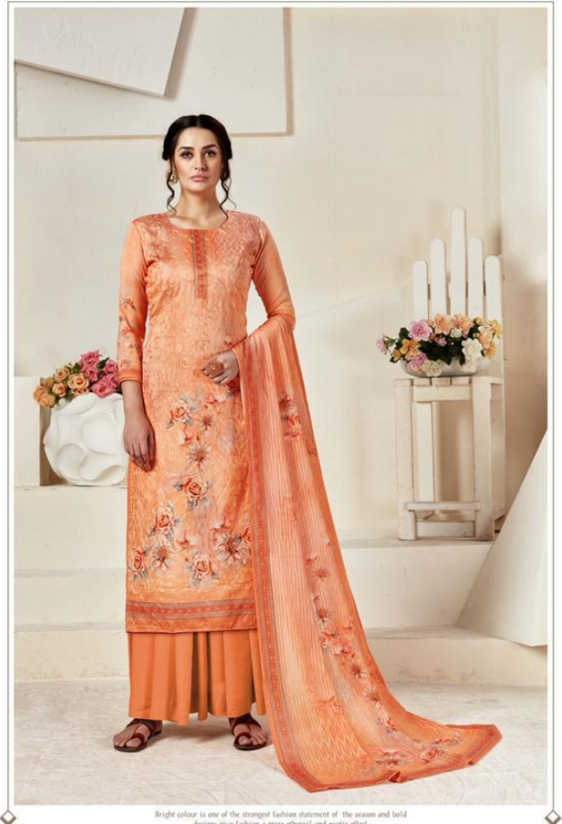
Bright colour is one of the strongest fashion statement of the season and bold designs give fashion a more ethereal and exotic effect. 42007