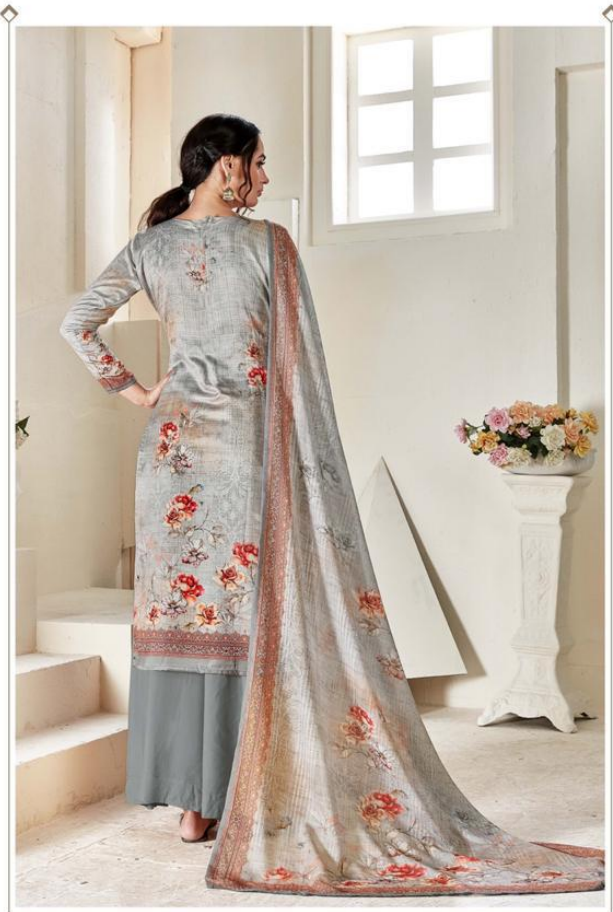
Bright colour is one of the strongest fashion statement of the season and bold designs give fashion a more ethereal and exotic effect. 43001