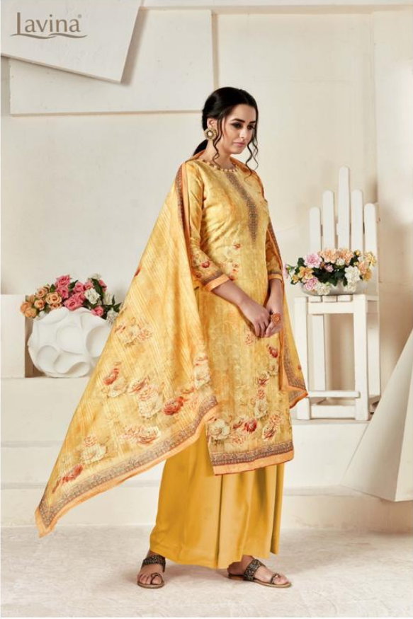
Bright colour is one of the strongest fashion statement of the season and bold designs give fashion a more ethereal and exotic effect. 42005