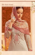
*** S.498-005 ***