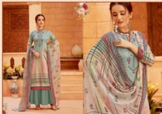
*** S.498-002 ***