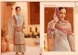
*** S.498-005 ***