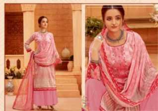
*** S.498-008 ***