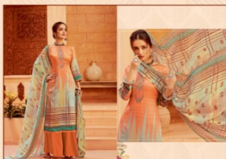
*** S.498-006 ***