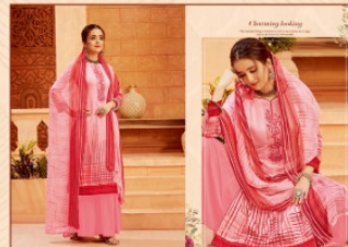
*** S.498-004 ***