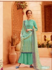
*** S.498-001 ***