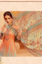
*** S.498-006 ***