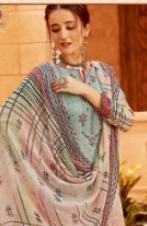
*** S.498-002 ***