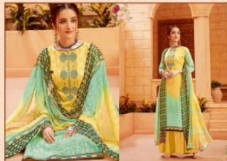
*** S.498-003 ***