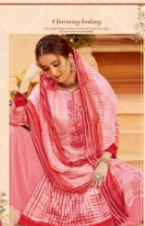
*** S.498-004 ***