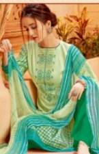
*** S.498-007 ***