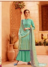
*** S.498-001 ***