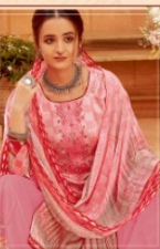
*** S.498-008 ***