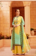
*** S.498-003 ***