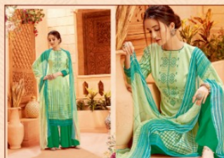
*** S.498-007 ***