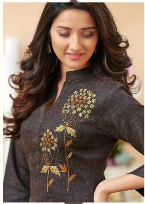
I DON'T DESIGN CLOTHES. I DESIGN DREAMS