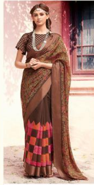
❖ 51976 ❖