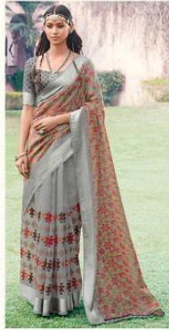
❖ 51981 ❖