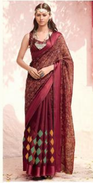
❖ 51974 ❖