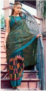
❖ 51974 ❖