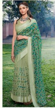
❖ 51976 ❖