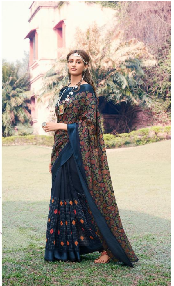
FASHION STYLE most glamorous queen