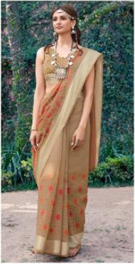
❖ 51978 ❖