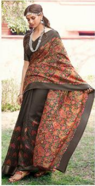
❖ 51980 ❖