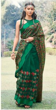
❖ 51978 ❖