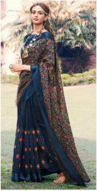
❖ 51971 ❖