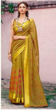
❖ 51973 ❖