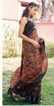
❖ 51981 ❖