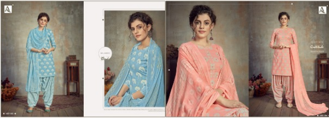
◆ I-627-003 ◆