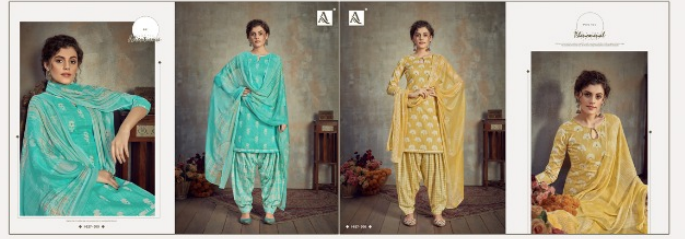
◆ I-627-005 ◆