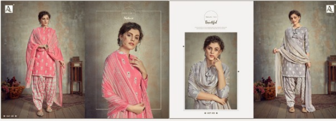
◆ I-627-001 ◆