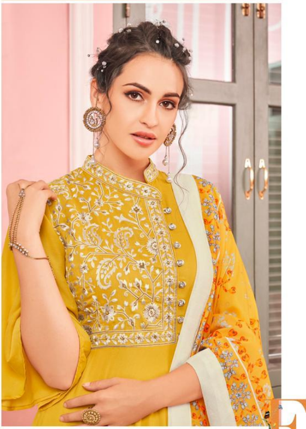
The contemporary design for the fashion conscious women who prize the traditional art and culture of India