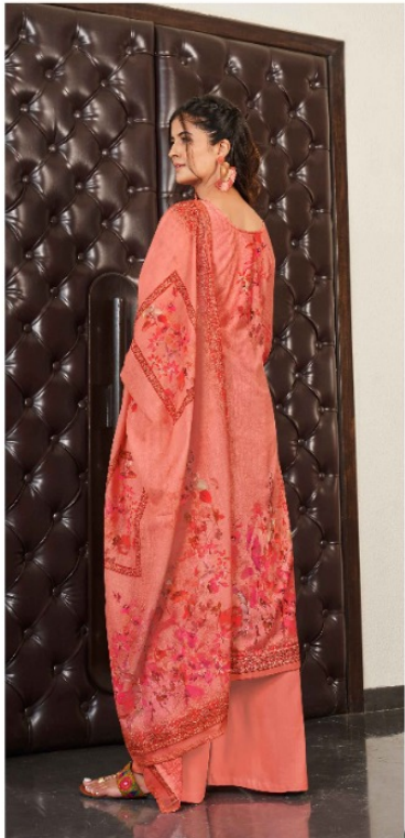
POWERFUL PRINTS & PATTERNS A FABURIN TREND FOR THE DARKING FASHIONISTA 1571