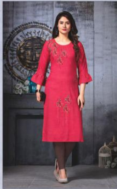
Bell Sleeves 008