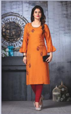
Bell Sleeves 007