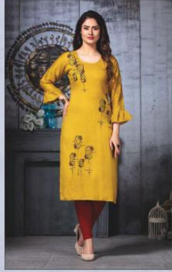
Bell Sleeves 005