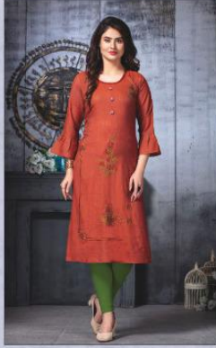
Bell Sleeves 002