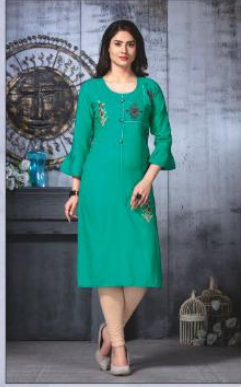
Bell Sleeves 003