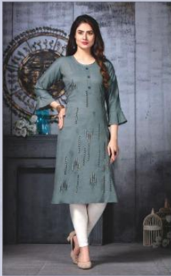
Bell Sleeves 006