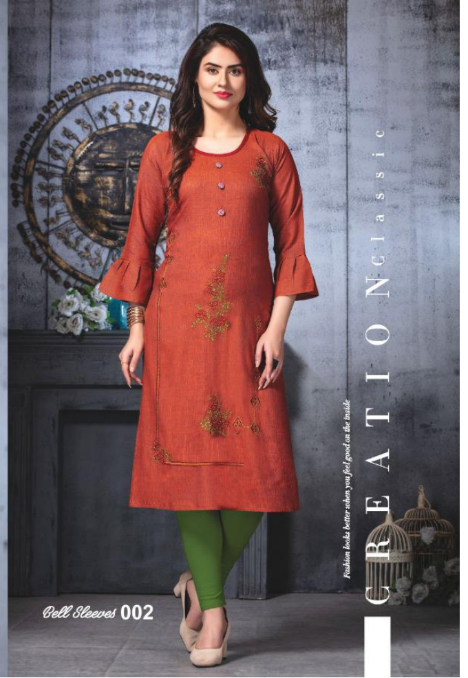
Bell Sleeves 002

Fashion looks better when you feel good on the inside.