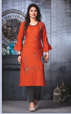
Bell Sleeves 004