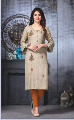
Bell Sleeves 001