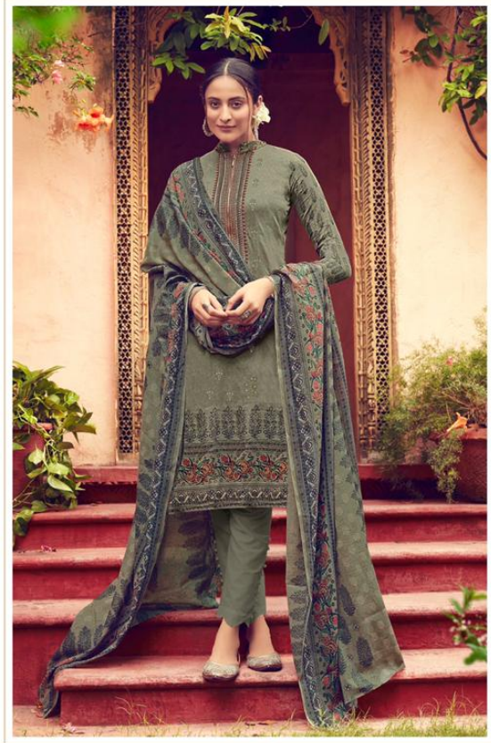
✽ 1004 ✽