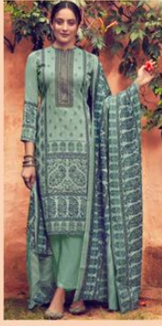
✽ 1003 ✽