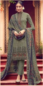
✽ 1004 ✽