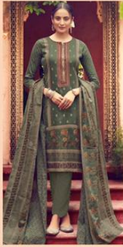
✽ 1006 ✽