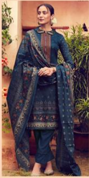
✽ 1005 ✽