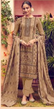
✽ 1002 ✽