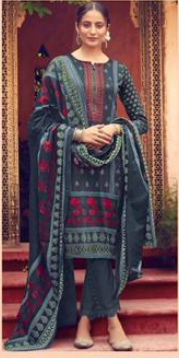
✽ 1001 ✽