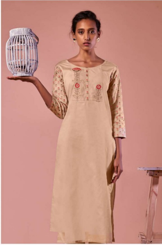
Every individual is an expression of the whole realm of nature, a unique action of the whole universe. This collection is all about coloured cotton knits to add a pop to your wardrobe.

four buttons Elegance · Designed & Delivered