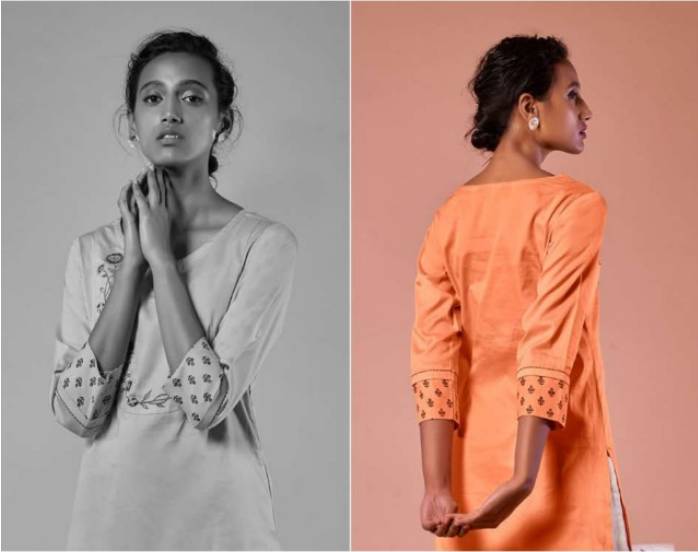
Every individual is an expression of the whole status of nature, a unique actor of the whole universe. This collection is all about colored cotton tunics to add a pop to your wardrobe.