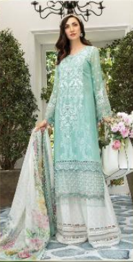
≡ 696 ≡