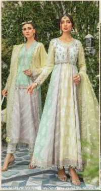
≡ 695 ≡