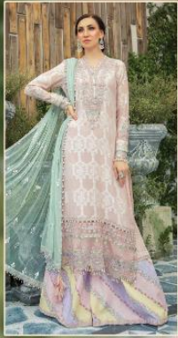
≡ 691 ≡