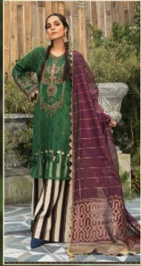
≡ 694 ≡