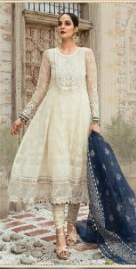
≡ 693 ≡