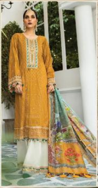
≡ 692 ≡