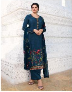
• 12571 •