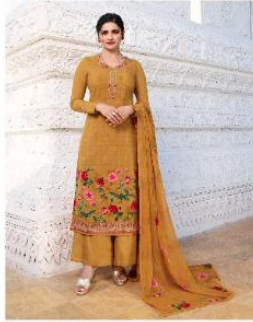
• 12574 •