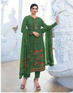
• 12573 •