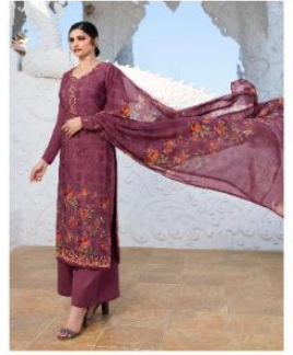
• 12576 •