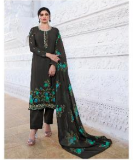
• 12578 •