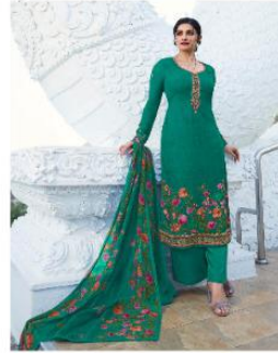
• 12577 •