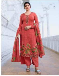
• 12572 •