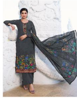
• 12575 •