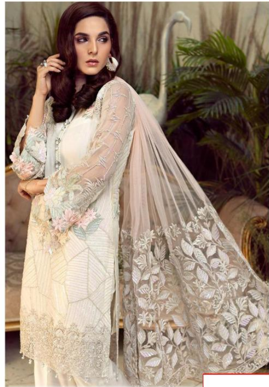
D.NO.1042 TOP - FOX JORJET WITH HEAVY EMBROIDERY BOTTOM INNER - HEAVY SANTOON DOPATTA - NET WITH HEAVY EMBROIDERY