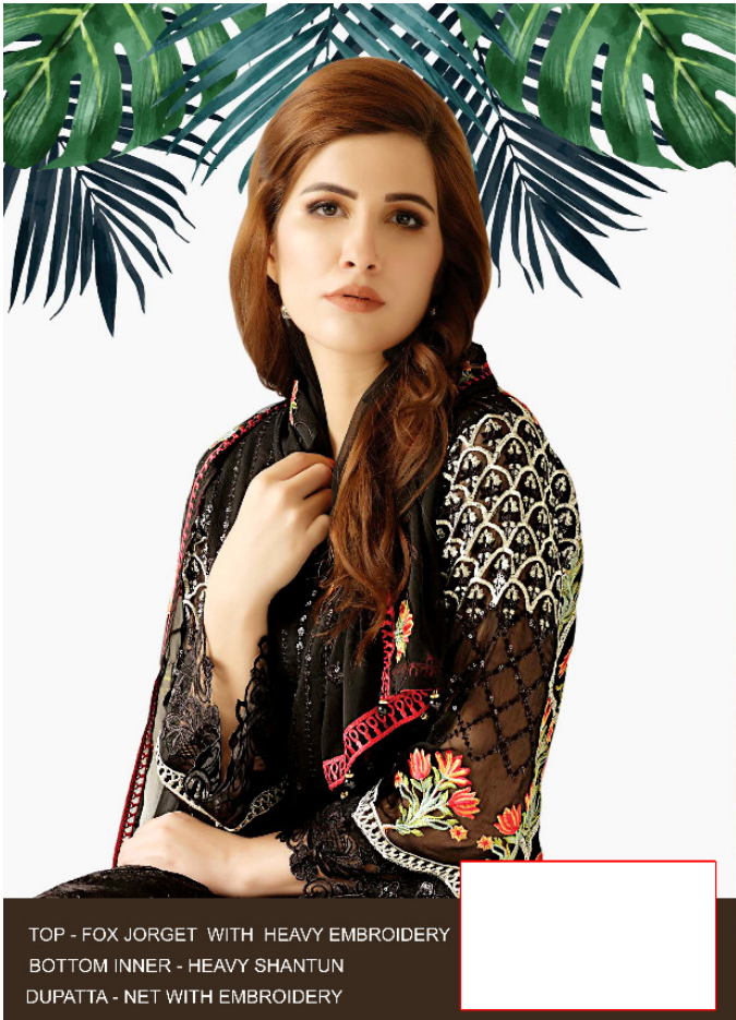
TOP - FOX JORGET WITH HEAVY EMBROIDERY BOTTOM INNER - HEAVY SHANTUN DUPATTA - NET WITH EMBROIDERY