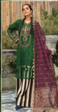
≡ 694 ≡