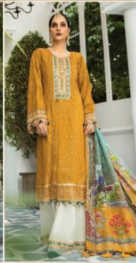
≡ 692 ≡