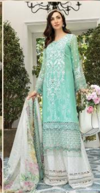
≡ 696 ≡