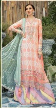
≡ 691 ≡