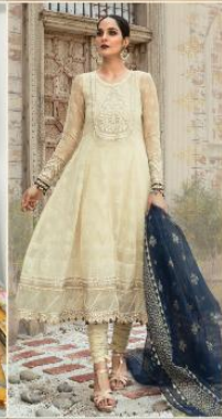
≡ 693 ≡