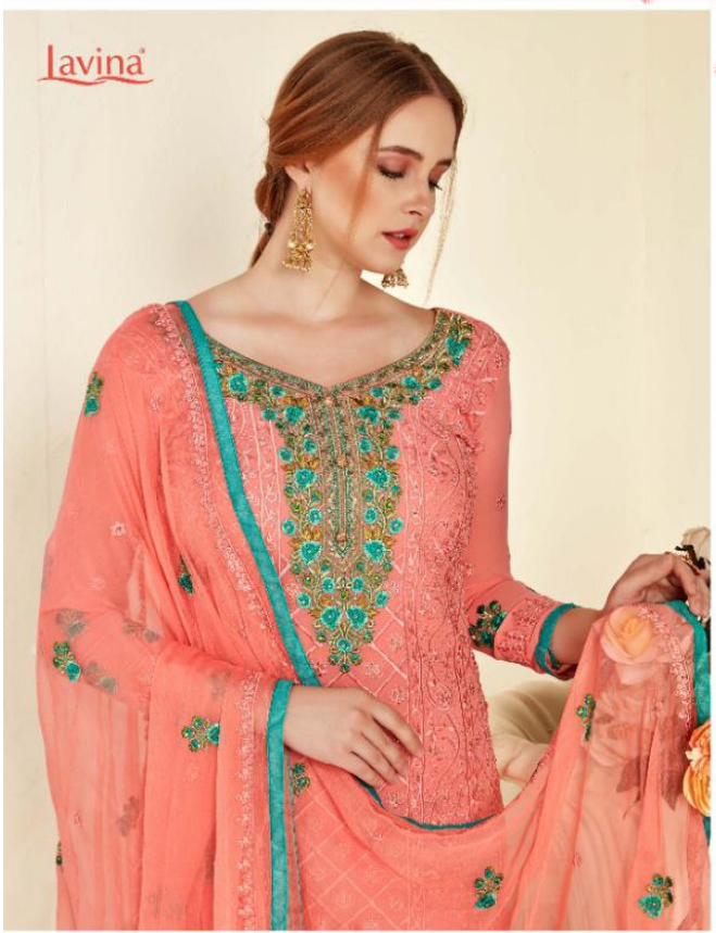
The series comprises of heavy fabrics from traditional motifs of embroidery, mirror work, bead and stone, sequin, organza, cotton, silk and handkerchief, and a lot of detail.