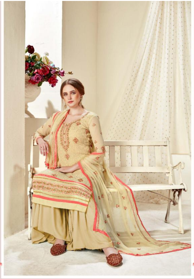
The ethnic elements of herve Pashmina from traditional motifs to contemporary essential WED 10.11.2019 10:00:00 AM