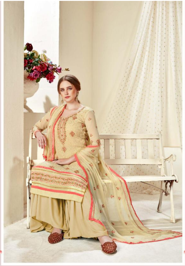
The ethnic elements of herve fashion from traditional motifs to contemporary essential 44005