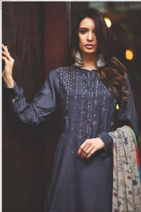
DESIGN No. 410