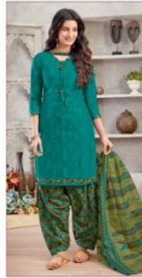
D. No. 22014