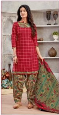
D. No. 22005