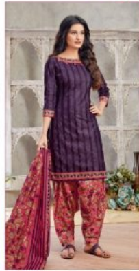
D. No. 22007