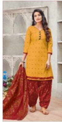
D. No. 22008