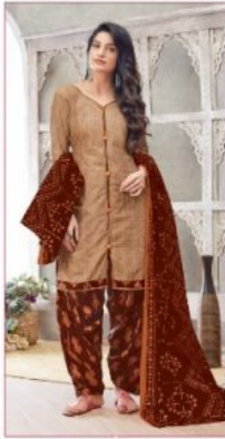
D. No. 22012