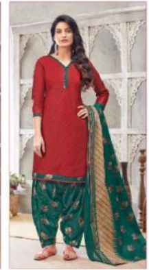
D. No. 22010