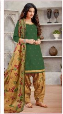
D. No. 22016