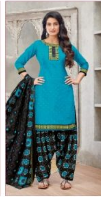
D. No. 22009