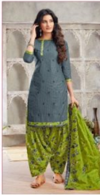
D. No. 22006