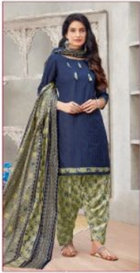
D. No. 22011