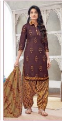
D. No. 22015