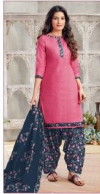
D. No. 22013