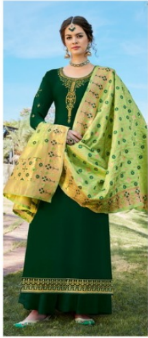
CODE # 4802