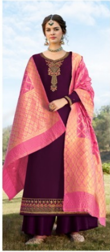
CODE # 4803