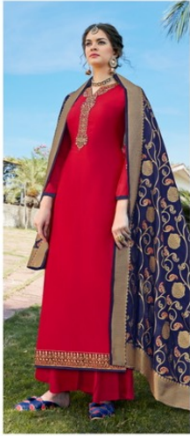
CODE # 4801