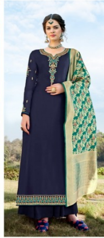
CODE # 4805