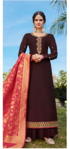
CODE # 4806