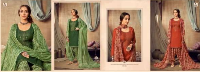
I 712 001