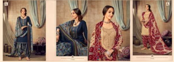
I 712 003