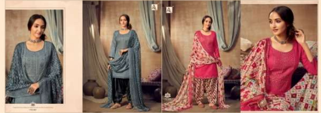
I 712 007