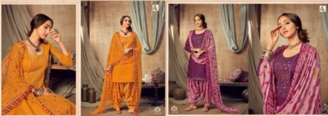
I 712 009