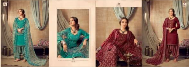
I 712 005