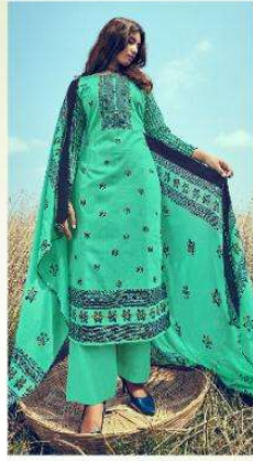
D.NO / 39002 ••