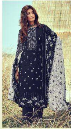
D.NO / 39006 ••