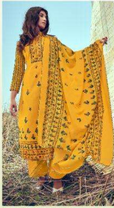
D.NO / 39005 ••