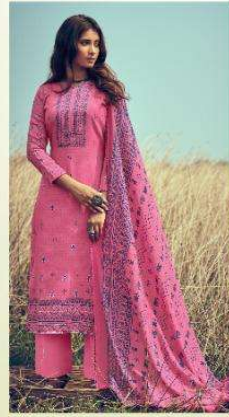
D.NO / 39007 ••