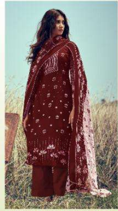
D.NO / 39008 ••