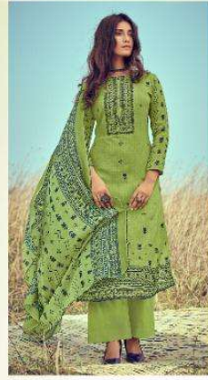
D.NO / 39003 ••