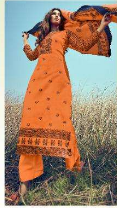
D.NO / 39004 ••