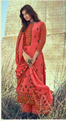
D.NO / 39001 ••