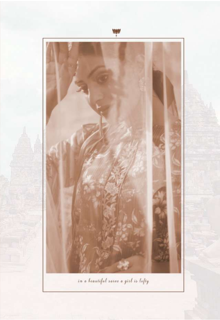
in a beautiful saree a girl is lofty