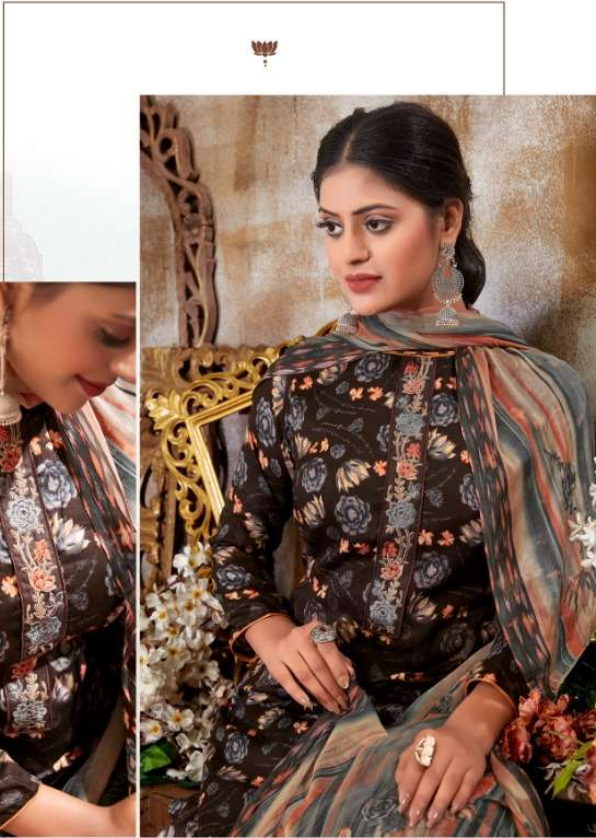
1002 you come..in a saree and tickle my senses