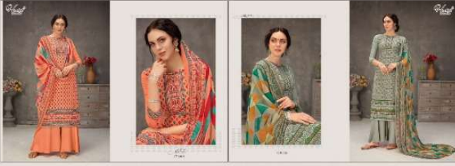
I 715 001