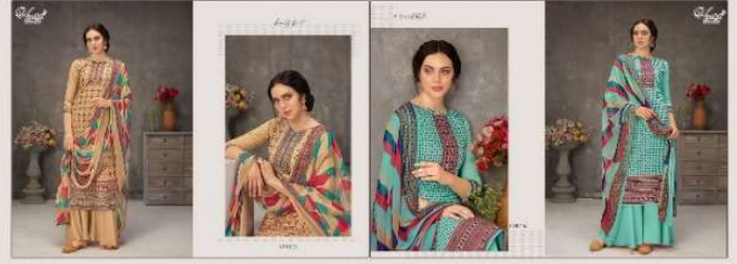
I 715 003