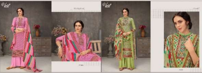
I 715 009