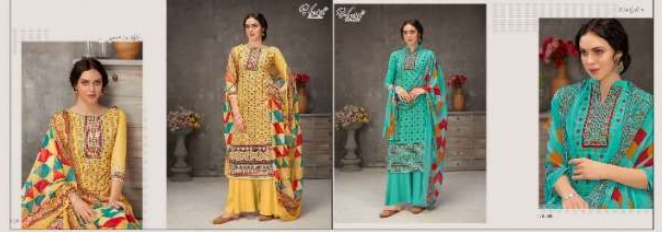
I 715 007