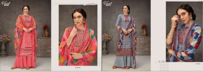
I 715 005