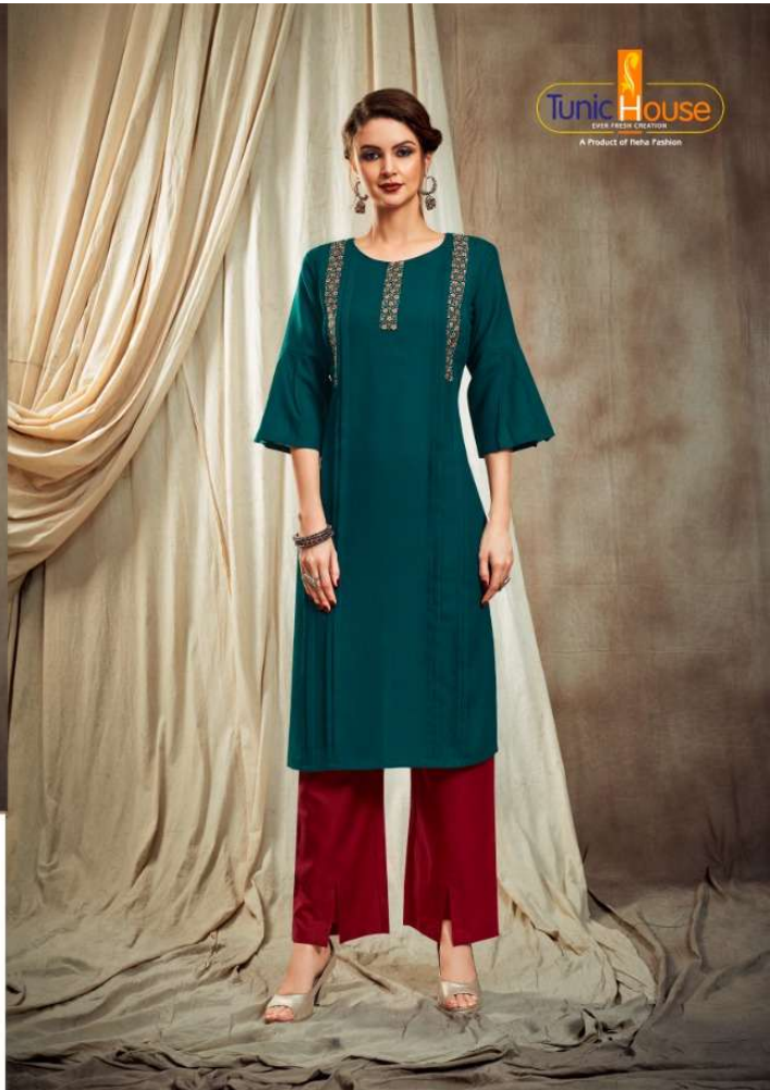
A breath taking array of fine detailing & intricate design inspired by Indian culture 2021