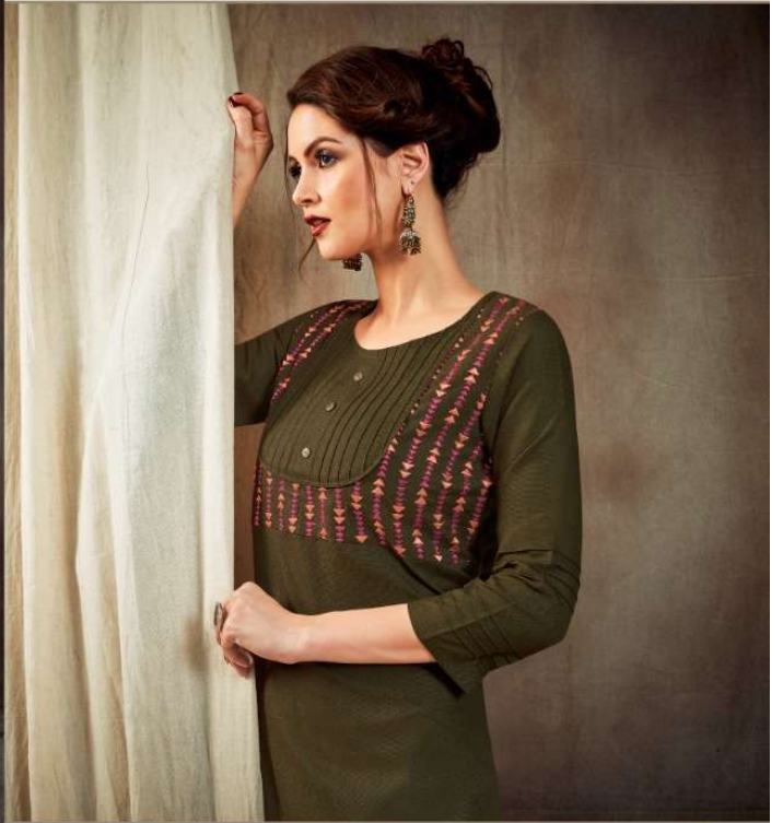
A scintillating plethora of timeless masterpieces inspired by beauty from Indian culture. 2020