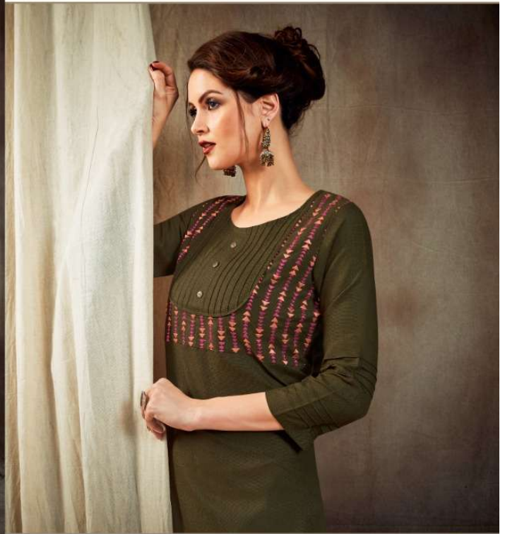
A scintillating plethora of timeless masterpieces inspired by beauty from Indian culture. 2020