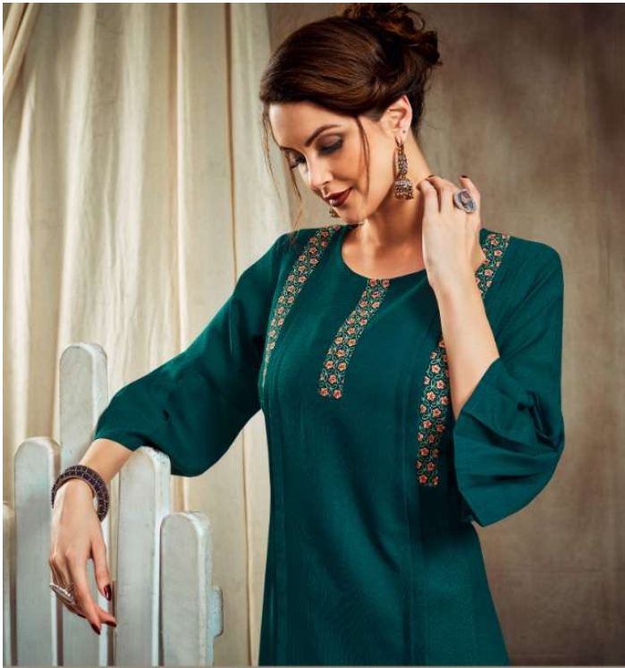
A breath taking array of fine detailing & intricate design inspired by Indian culture 2021