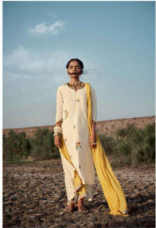
Under the charming moonlight, adorned with shells and rustic accessories, this collection by Ganga Fashions centres around the spirit of the gentle sand. Bringing an earthen essence to life, these attires have decorous prints that signify warmth and comfort.