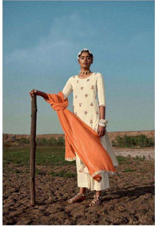
Under the charming moonlight, adorned with shells and rustic accessories, this collection by Ganga Fashions centres around the spirit of the gentle sand. Bringing an earthy essence to life, these attires have decorous prints that signify warmth and comfort.