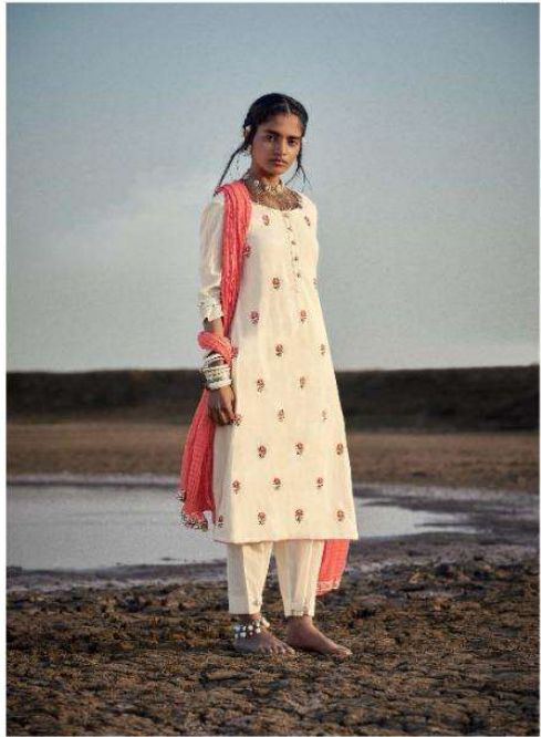
Under the charming moonlight adorned with shells and rustic accessories this collection by Ganga Fashion centres around the spirit of the gentle sea. Bringing an earthy essence to life, these styles have decousu prints that slightly warm and soothe.