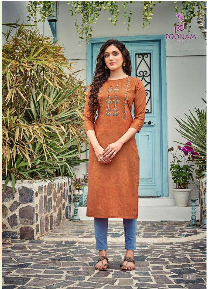
Every day is a fashion show & the world is your runway