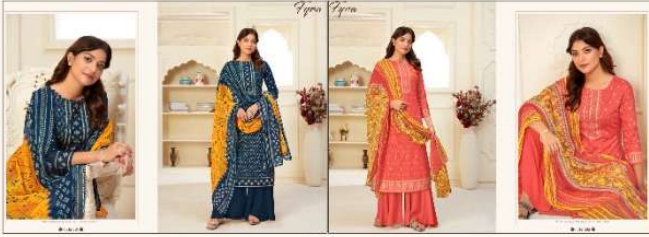
I 716 001