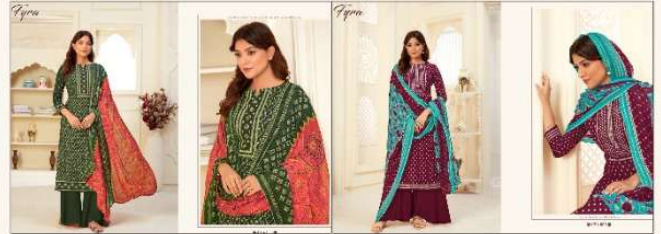
I 716 007