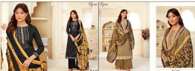
I 716 009