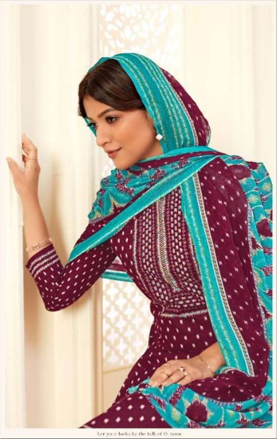
Let your looks be the talk of the town.