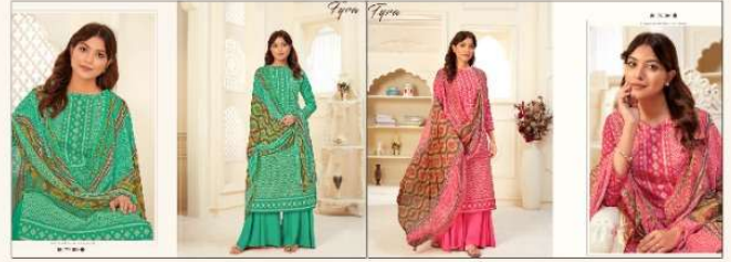
I 716 003