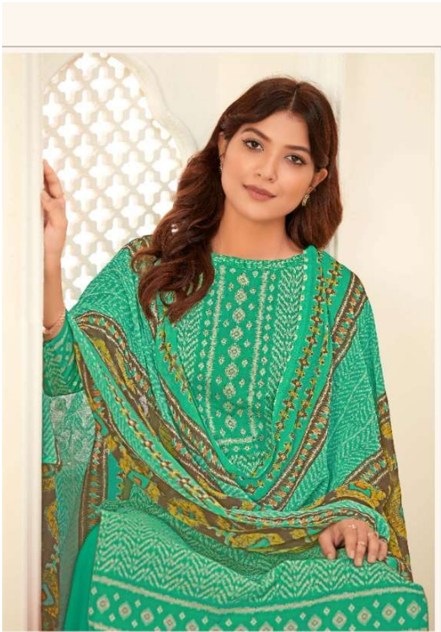
And live and love as the morning sun.