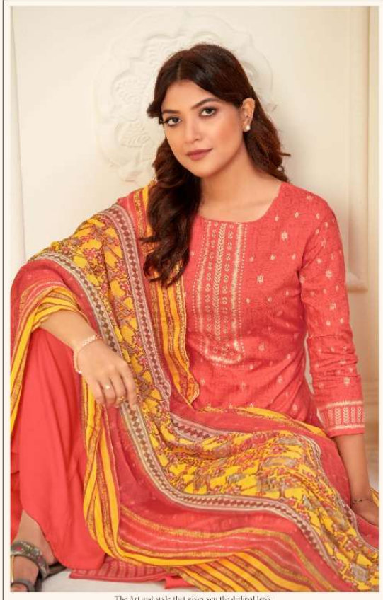
The Art and style that gives you the desired look