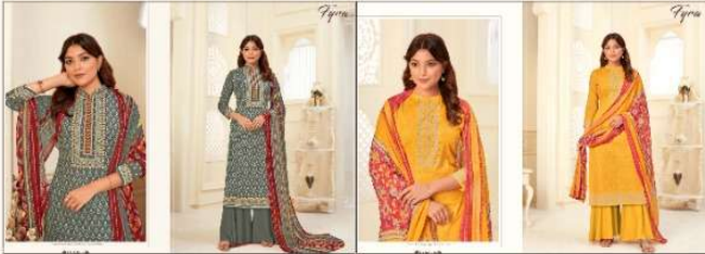
I 716 005