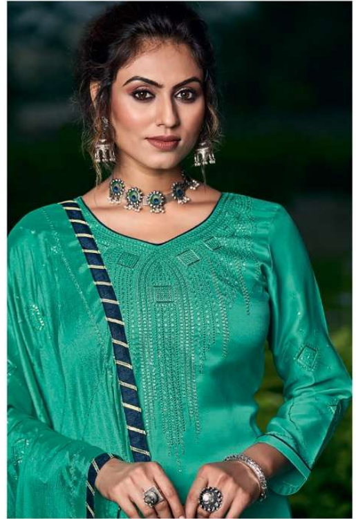
LUXE FABRICS. BOLD PATTERNS & SUMPTUOUS DETAILING ADORN MODERN SILHOUETTES.