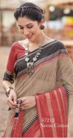
47212 Neem Cotton