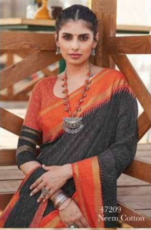
47209 Neem Cotton