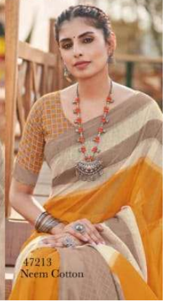
47213 Neem Cotton