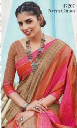
47207 47208 Neem Cotton - Neem Cotton