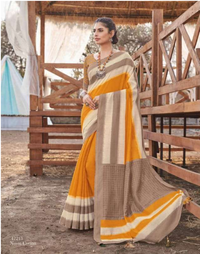
42213 Neemi Cotton