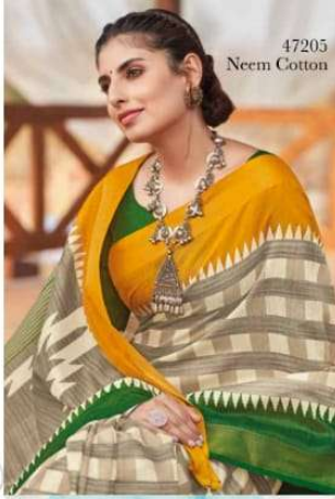
47205 Neem Cotton