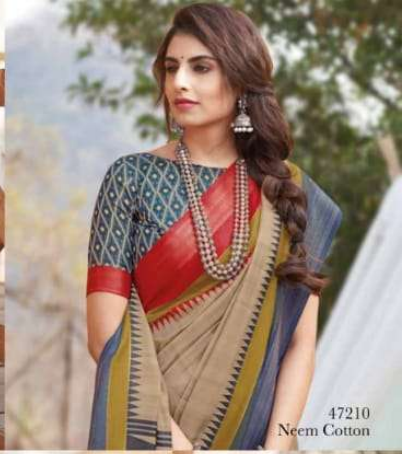
47210 Neem Cotton