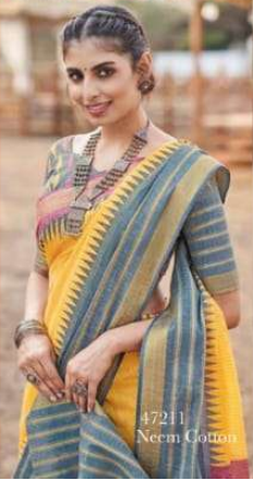
47211 Neem Cotton