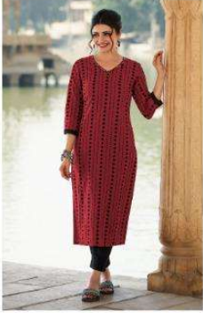
• 39033 •