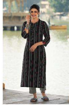
• 39037 •