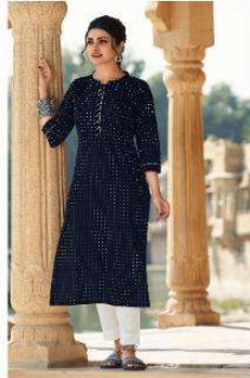
• 39034 •