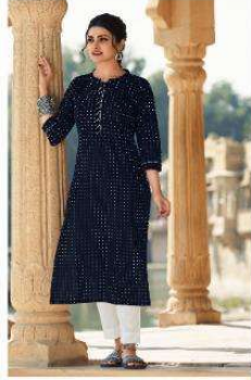
• 39034 •