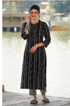
• 39037 •