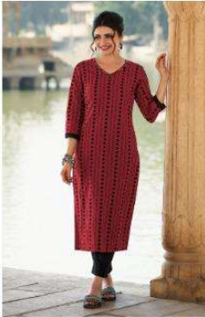
• 39033 •