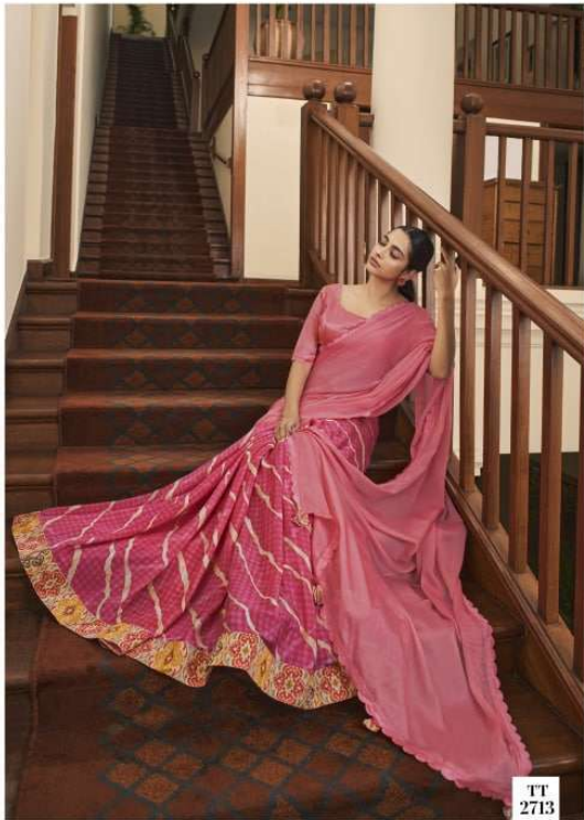
The classic peach in soothing chiffon is a minimalistic choice for balmy days. Wear an arrangement of mogrus that calls for a celebration that is YOU.