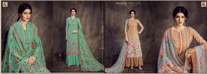
I 631 005