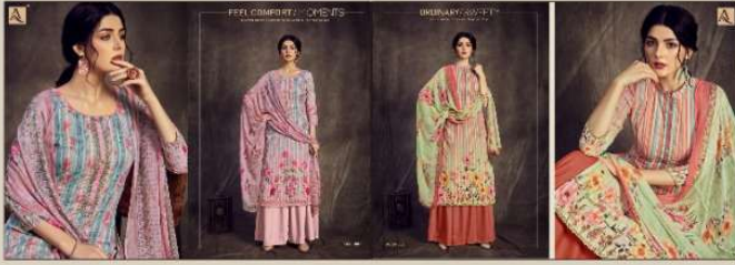
I 631 001