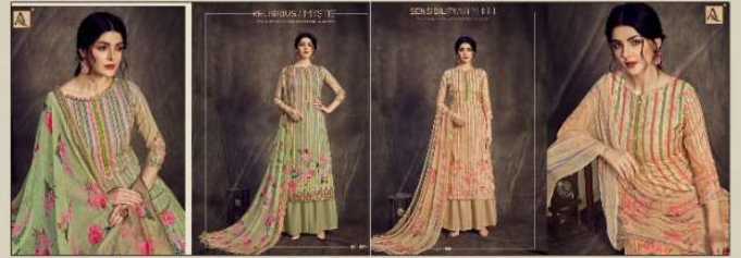
I 631 007