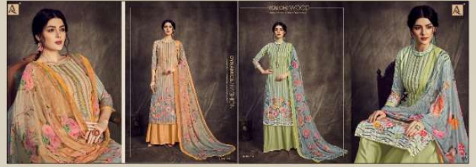
I 631 003