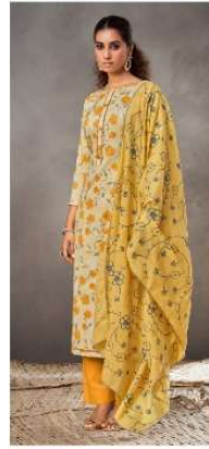
D. No. 3058