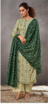
D. No. 3051