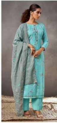
D. No. 3056