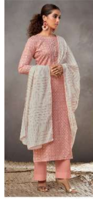
D. No. 3054