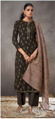
D. No. 3055