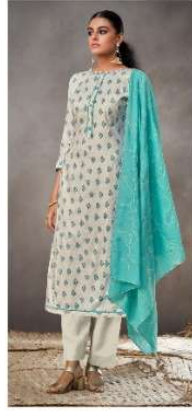
D. No. 3053