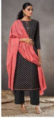
D. No. 3052