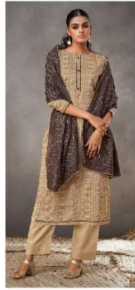
D. No. 3057