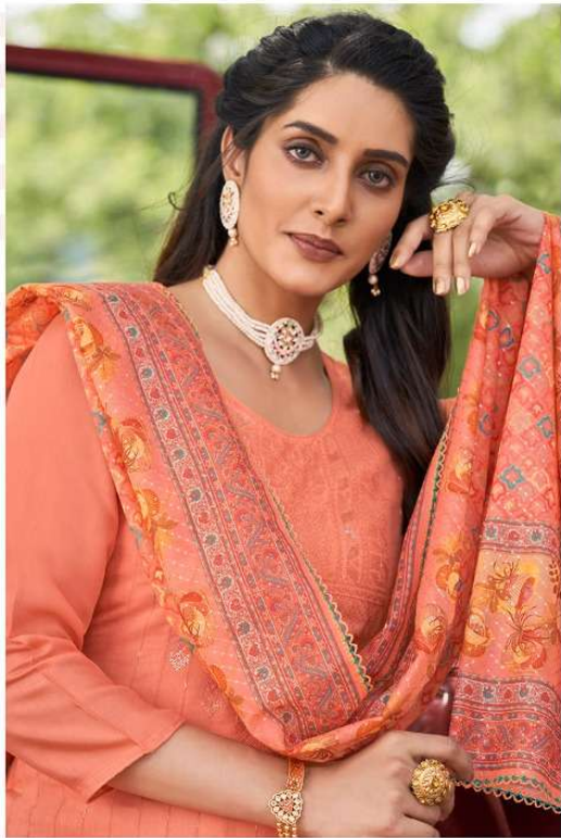
Embrace one of the purest trends this season.