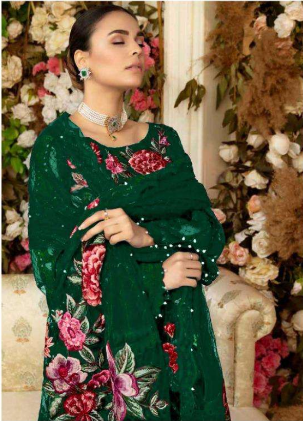
TOP - BUTTERFLY NET EMBROIDERED WITH PATCH INNER BOTTOM - HEAVY SANTOON SILK DUPATTA - BUTTERFLY NET EMBROIDERED