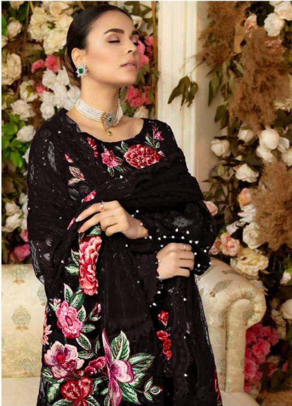
TOP - BUTTERFLY NET EMBROIDERED WITH PATCH INNER BOTTOM - HEAVY SANTOON SILK DUPATTA - BUTTERFLY NET EMBROIDERED