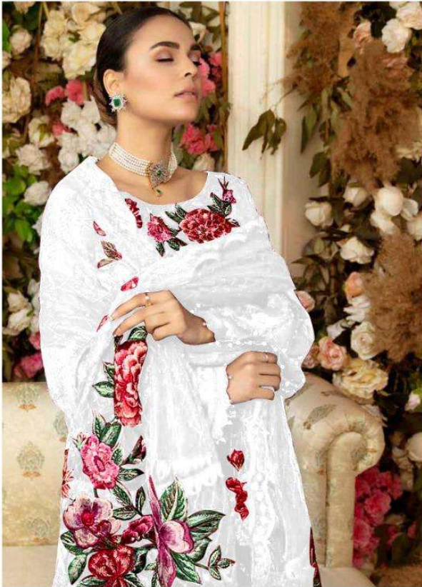
TOP - BUTTERFLY NET EMBROIDERED WITH PATCH INNER BOTTOM - HEAVY SANTOON SILK DUPATTA - BUTTERFLY NET EMBROIDERED