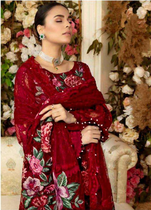
TOP - BUTTERFLY NET EMBROIDERED WITH PATCH INNER BOTTOM - HEAVY SANTOON SILK DUPATTA - BUTTERFLY NET EMBROIDERED