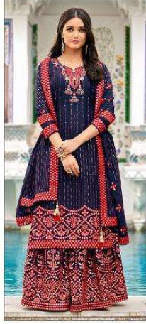
▶ 1316 ◀