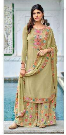
▶ 1319 ◀