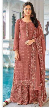
▶ 1317 ◀