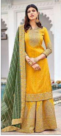
▶ 1315 ◀