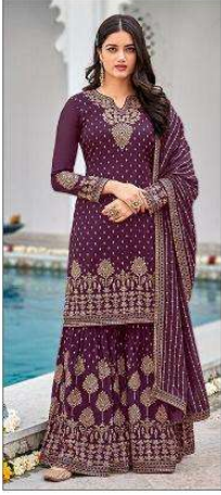
▶ 1314 ◀