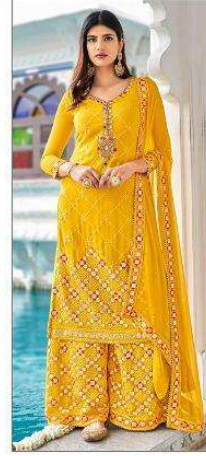
▶ 1318 ◀