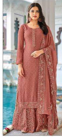
▶ 1317 ◀