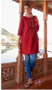
5 1 0 3