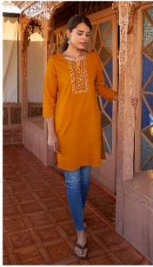
5 1 0 1