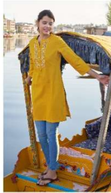
5 1 0 4