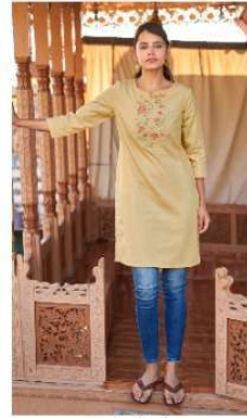
5 1 0 6