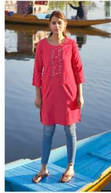
5 1 0 5