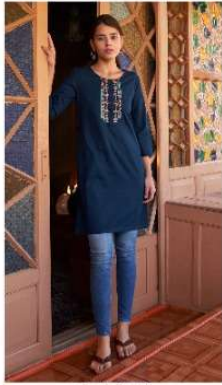
5 1 0 2