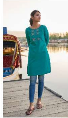
5 1 0 7