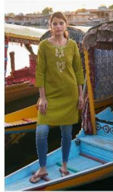
5 1 0 8