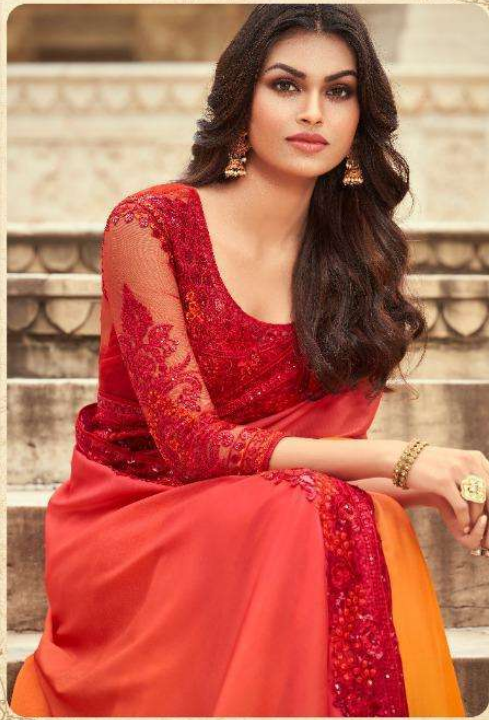
This elegant traditional saree is both sexy & sultry. It has a wide netting and long sequin sleeves. SW-805