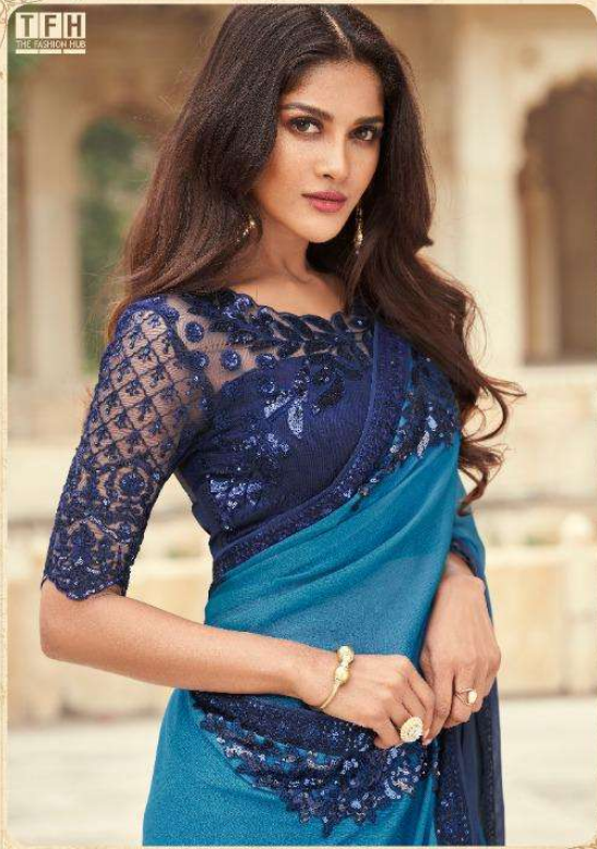
Geometric saree with floral embroidery blouse. Fabric: 100% Polyester and Viscose.