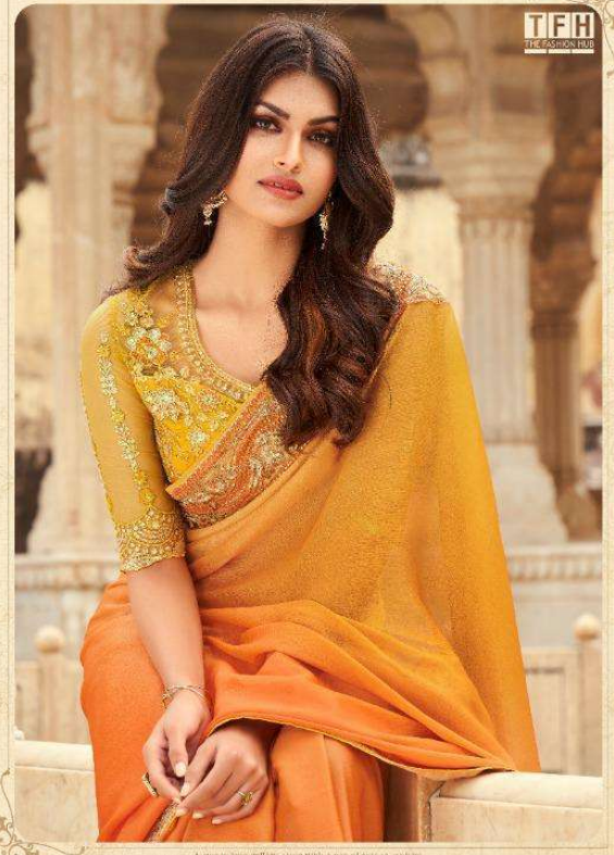
A timeless yellow saree with a pair of orange saree. This is the beauty of celebrating culture. The world brings its smallest embroidery all over it. SW-802