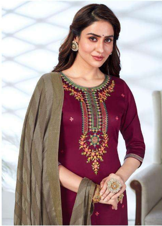
-3111- I hope this moment will last forever