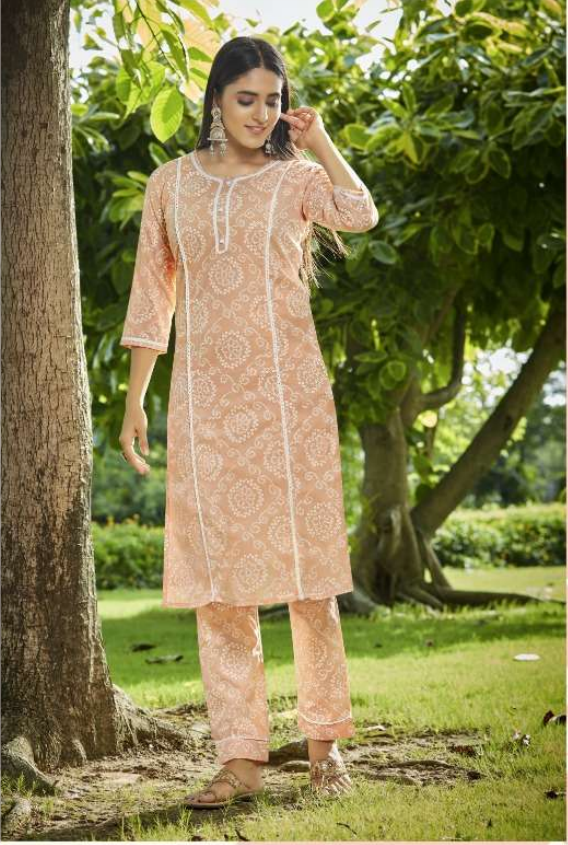
D.NO.1002 You can see and feel everything in clothes