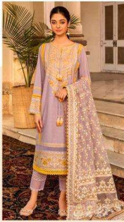
DESIGN | 1141