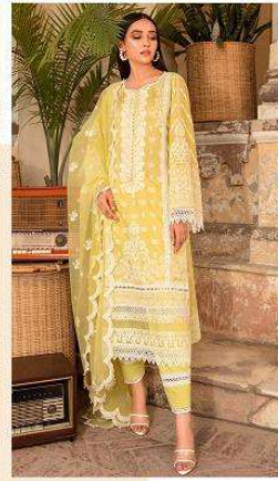
DESIGN | 1146