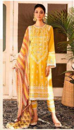
DESIGN | 1142