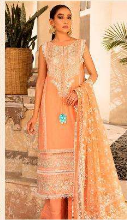
DESIGN | 1144