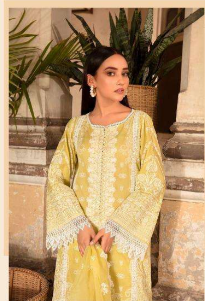
DESIGN | 1146