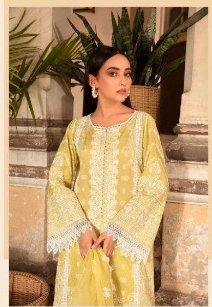
DESIGN | 1146