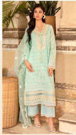
DESIGN | 1145