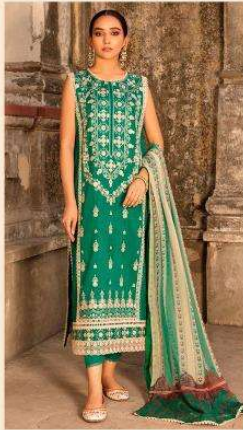
DESIGN | 1143