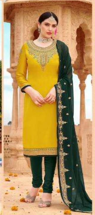
D. NO - 1011