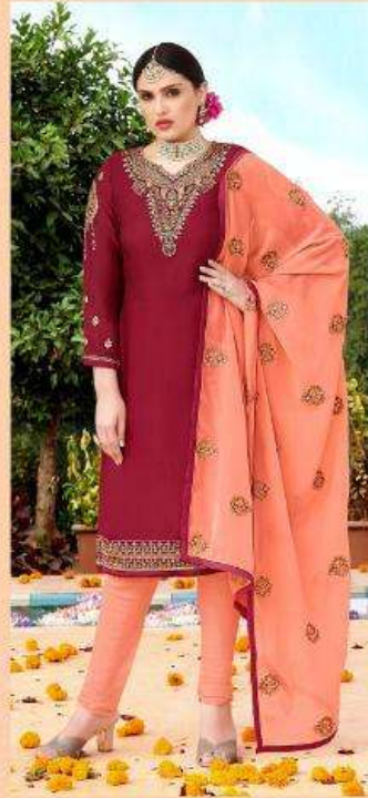
D. NO - 1010