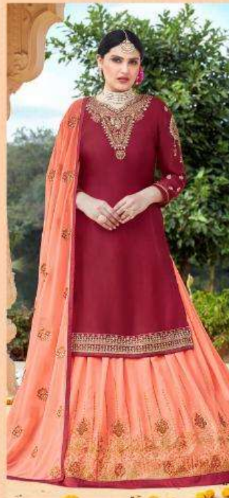
D. NO - 1010