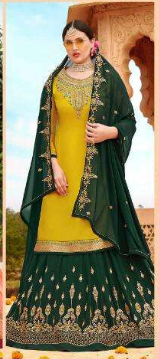
D. NO - 1011