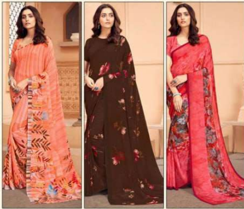
Tamanna-513 Tamanna-514 Tamanna-515