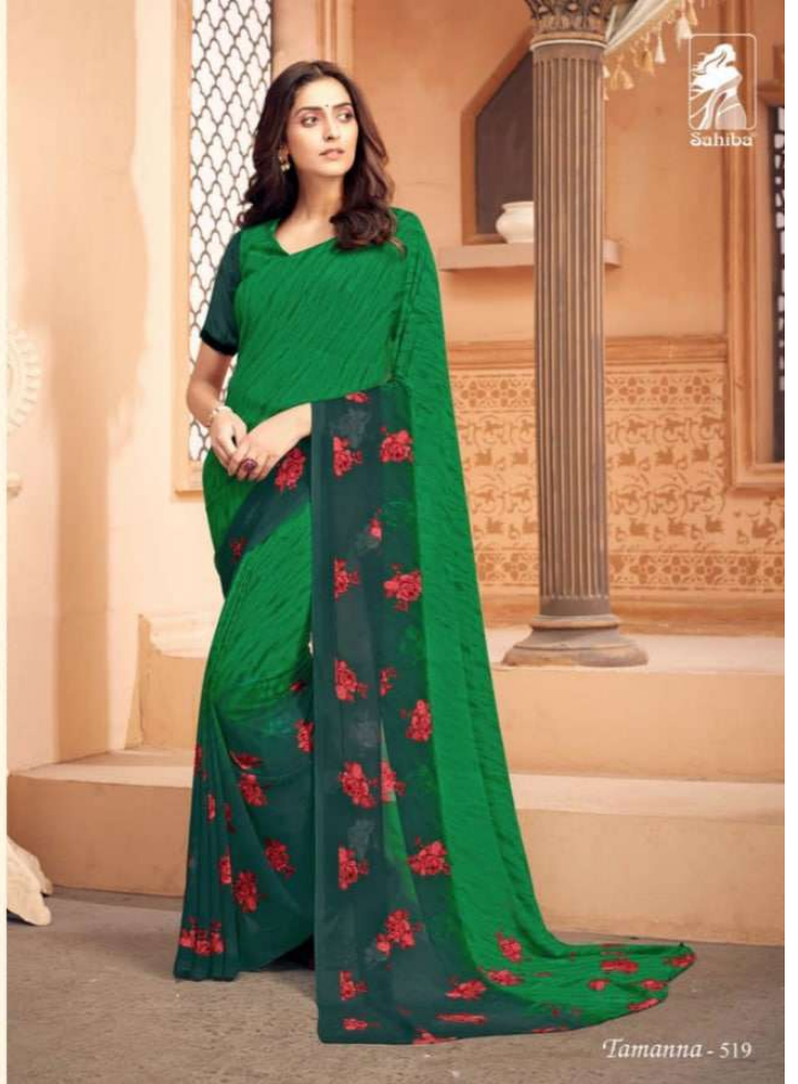
Tamanna - 519