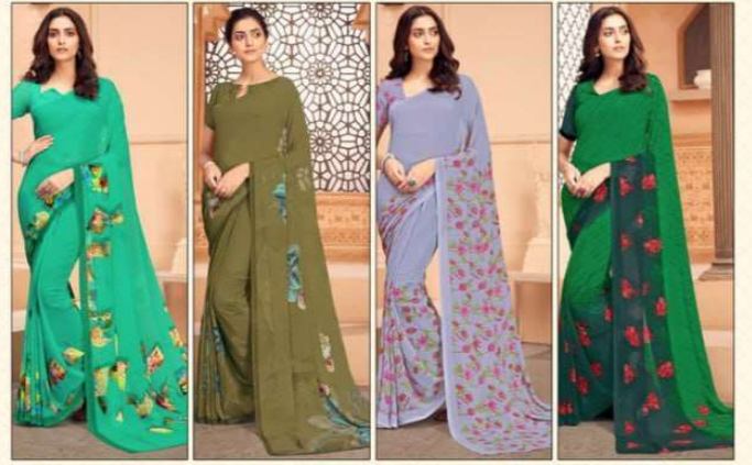
Tamanna-516 Tamanna-517 Tamanna-518 Tamanna-519