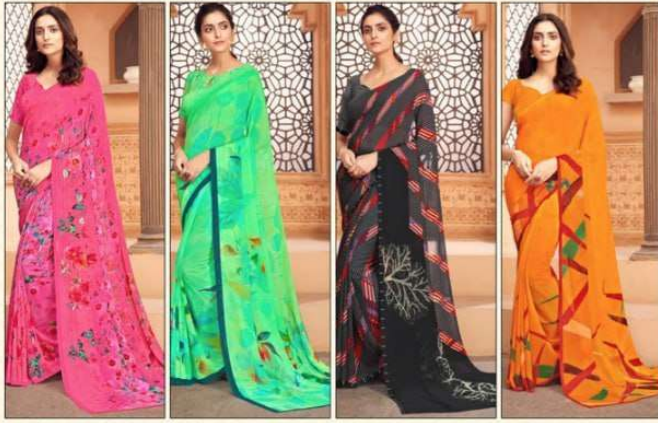
Tamanna-509 Tamanna-510 Tamanna-511 Tamanna-512