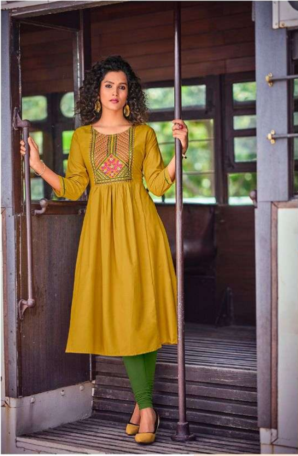
Culture club 'Welcome to the new age of style in Indian Saree. Where an unmatched prints designs and beautiful feelings of fabric.